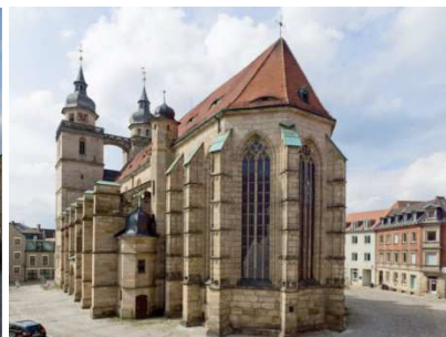
City Church of Bayreuth