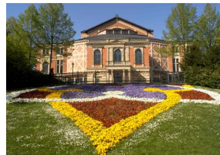
Richard Wagner Festival Theatre