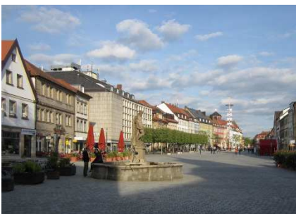
City Center of Bayreuth

Siemensstraße 45 63071 Offenbach Tel +49 69 975861-0 Fax +49 69 975861-99 dgg@hvg-dgg.de www.hvg-dgg.de